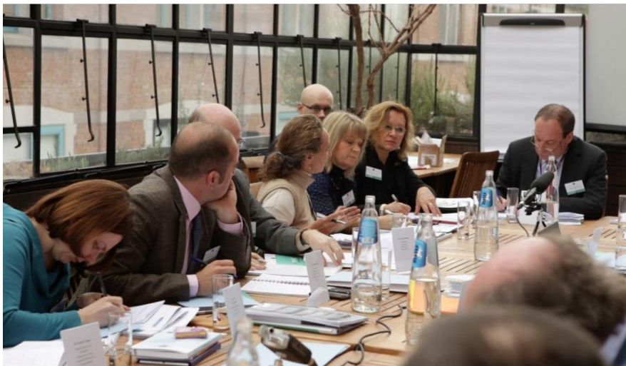
Round Table 1, Brussels, 3 March 2015.

It was felt that the Agreement should move away from the donor-recipient relationship and aim towards a partner-to-partner Agreement. Participants discussed the desirability of establishing a partnership with a sense of shared responsibility. This would in turn require that the partnership be built on trust and shared values. The issue of whether the partnership should be built with conditionalities was also discussed and participants explored the