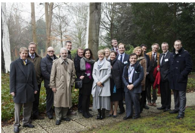
Round Table 3, Federal Ministry of Economic Cooperation and Development (BMZ), Bonn, 10 March 2015.

Traditionally, the partnership has appeared to give more weight to the financial means of implementation. However, increasingly, ACP voices argue that equitable investment and