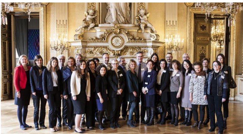
Round Table 2, Ministry of Foreign Affairs, Paris, 13 March 2015.

For development cooperation, the post-2015 development agenda also offers an opportunity to stress policy coherence for sustainable development. If fully implemented, the SDGs will require a change in our governance structure, by demanding increasing cooperation across ministries. In the Round Table discussions, doubts were expressed regarding whether the EU with its Member States and the ACP countries were prepared for this kind of radical change in governance. Despite their revolutionary potential, the implementation of the SDGs may be difficult because of the way they are structured, with the 17 goals and 169 targets proposed. There is also a concern that the SDGs may not be fully implemented, as the post-2015