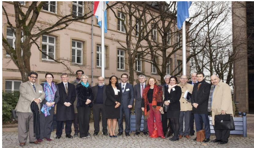
Round Table 5, Ministry of Foreign Affairs, Luxembourg, 24 March 2015.

Looking forward, the key question for the Round Table was: with the overarching goals of poverty eradication and sustainable development in the present CPA, what are the expected contributions of the traditional twin areas of EU support that are indeed “Regional Integration” and