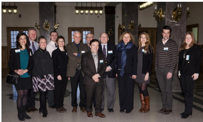
Round Table 7, Ministry of Foreign Affairs, Riga, 31 March 2015.

The annual rates of demographic growth (table 1) reveal that the almost static demography of the EU's population (0.1%) runs counter to the demographic dynamism of African ACP countries (the growth of the two other groups is slower). As for GNP per capita, the variances are very high between the EU and ACP countries of Africa and the Pacific,