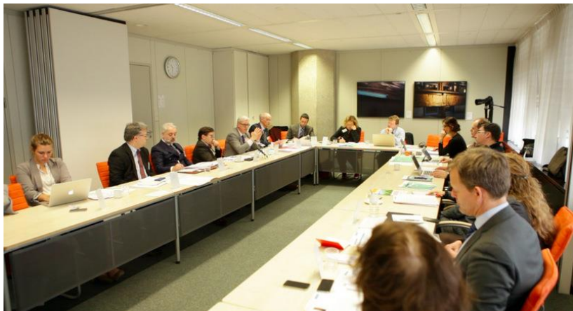
Round Table 4, Ministry of Foreign Affairs, The Hague, 6 March 2015.

The first session focused mainly on discussing the performance of the current institutions, particularly from an ACP perspective. The participants noted i) how institutions need to be improved, and ii) how often institutional structures are not sufficiently flexible or reactive enough to respond appropriately to past and present challenges. It was also noted that the commitment to participate and deliver results is uneven among the parties: both the ACP countries and the EU have shown reduced commitment in different areas of the partnership, which has further undermined the effectiveness of Cotonou. For example, there has at times been a low level of participation by EU members in the Joint Parliamentary Assembly, and poor attendance by EU