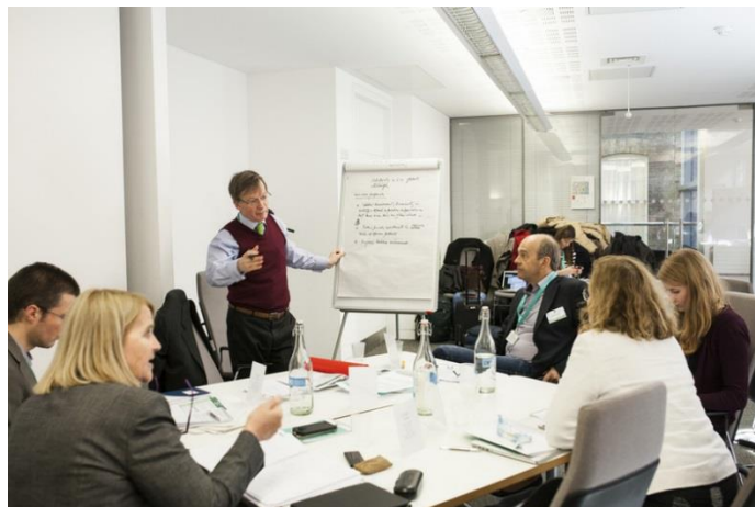
Round Table 6, Department for International Development (DFID), London, 27 March 2015.